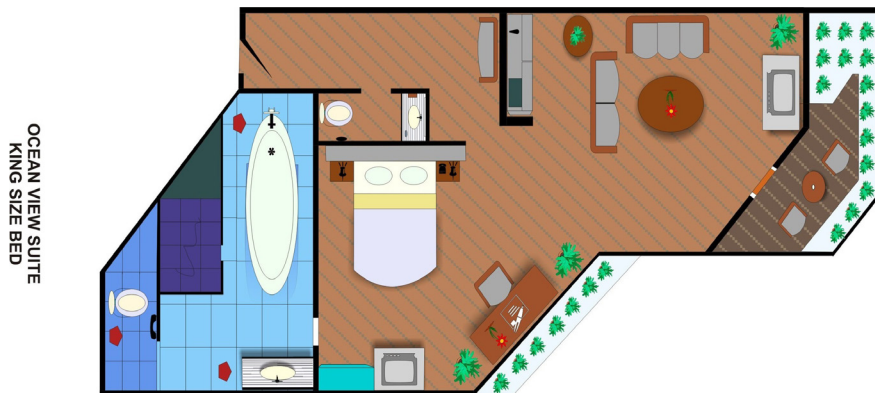
OCEAN VIEW SUITE KING SIZE BED

Maximum Occupancy : 2 adults and 2 children less than 12 years old or 3 adults and 1 child below 12 years using existing (1 king size) bedding plus max one additional roll away bed per suite.